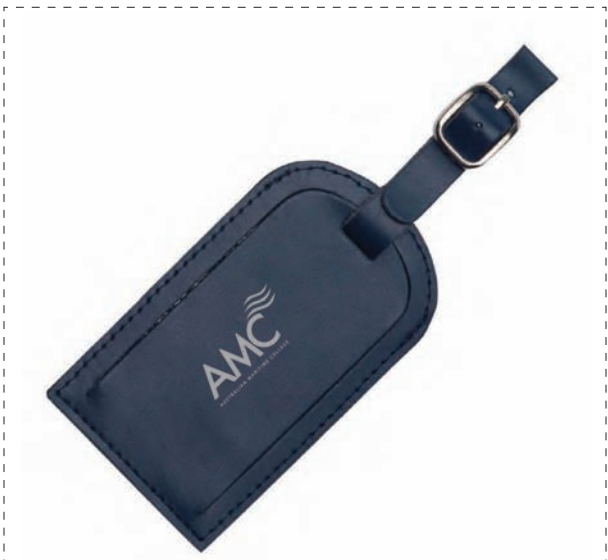
005 | AMC LUGGAGE TAGS