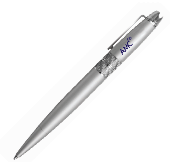
009 | AMC METALLIC PEN WITH DETAIL