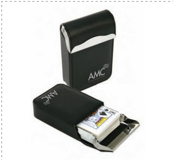
006 | AMC PLAYING CARDS