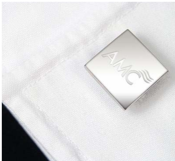
007 | CUFF LINKS