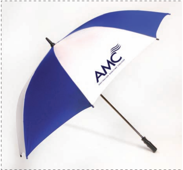
001 | AMC UMBRELLAS