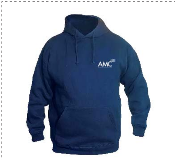
003 | AMC HOODIES