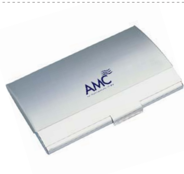
010 | AMC ALUMINUM BUSINESS CARD HOLDERS