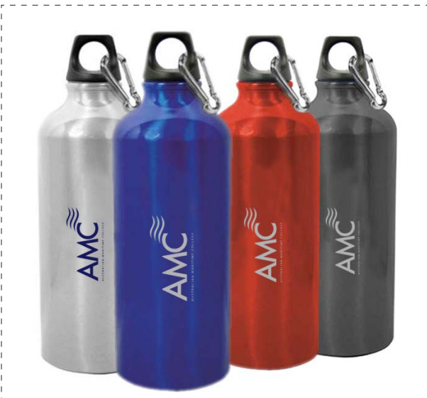
004 | AMC ALUMINUM DRINK BOTTLES