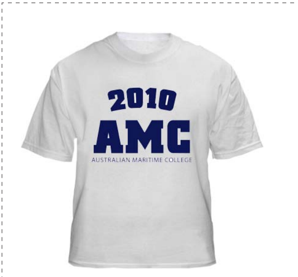
002 | AMC T-SHIRTS